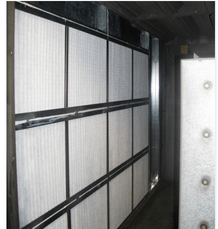
Modification of filter banks